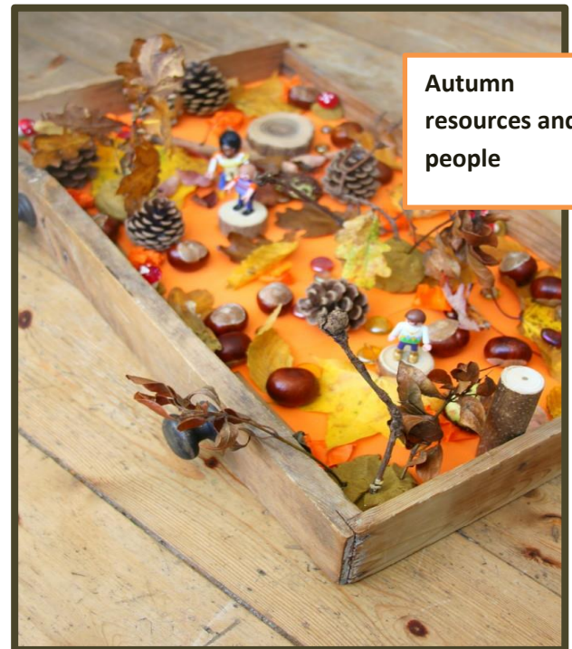
Autumn resources and people

Small world toys and open ended resources and role play are great for this.