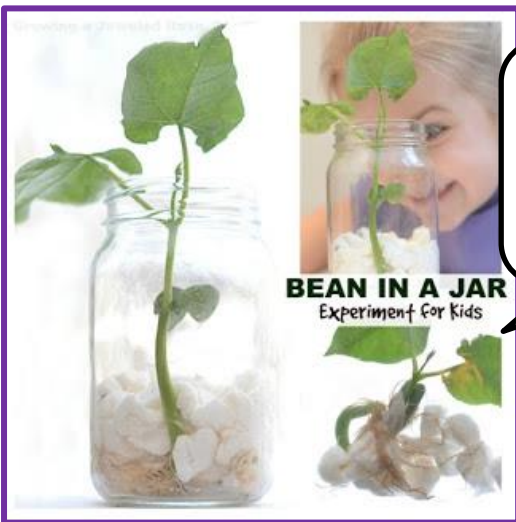
BEAN IN A JAR Experiment for Kids

Please bring in a named glass jar so your child can grow a bean and take it home and nurture it!